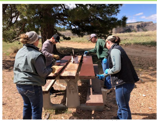
Painting new picnic table

The Outlaw Cave Campground, a first-come, first-served primitive campground, sits at the top of the Middle Fork Powder River Canyon, offering stunning views and a foot trail to the river. The tables at the Outlaw Cave Campground had been in need of repair and replacement for several years. In FY21, the Buffalo Field Office purchased and painted 25 boards for picnic tables and benches for picnic table repair. The project was completed in spring 2022.