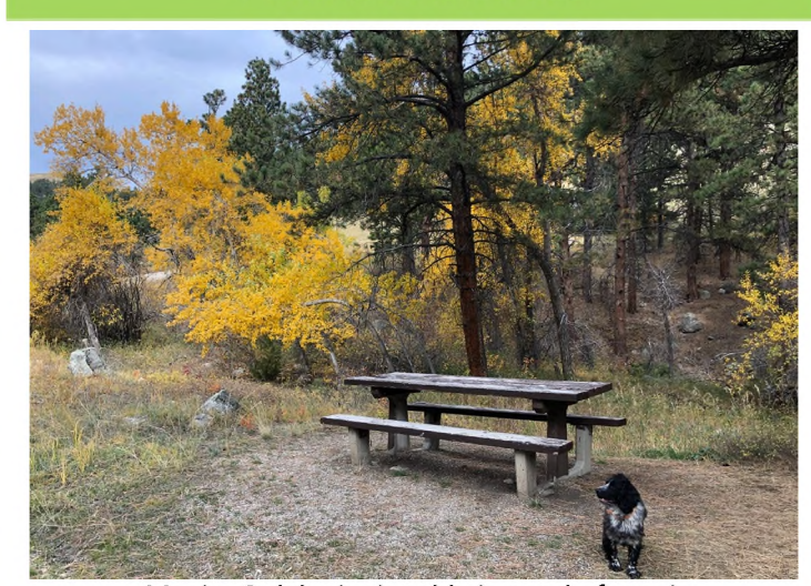
Mosier Gulch picnic table in need of repair