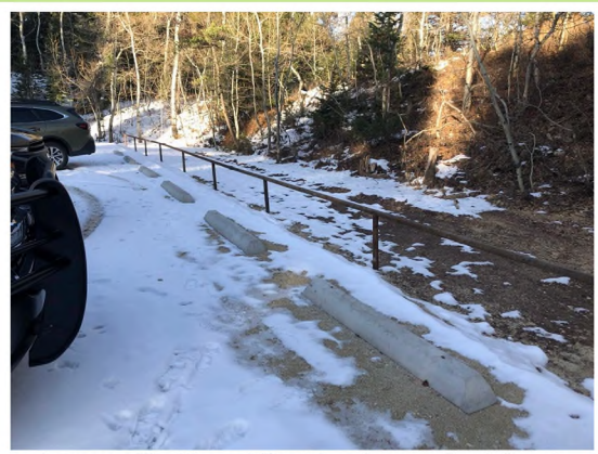
Aspens Trailhead Parking Lot at Red Grade

The BLM BFO has worked extensively with the Sheridan Community Land Trust (SCLT) to design ~5 miles of hiking and biking trails and one parking area/trailhead on the Red Grade parcel. The whole trail system falls on State, BLM and USFS lands, and the BLM is supporting SCLT with funds for trail construction. In 2022, SCLT completed construction of the Aspens Trailhead Parking Lot on BLM surface. This parking lot holds up to 10 vehicles and provides access to several hiking and biking trails.