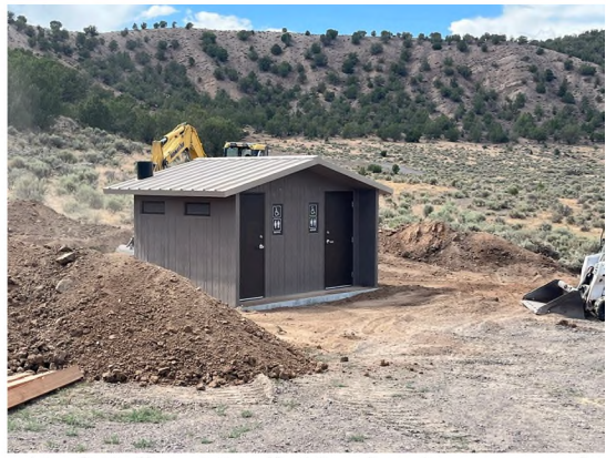
Vault Toilet at Saul's Meadow Campground

In 2022, the RFO made great progress on the Saul's Meadow Campground. Our partner Sevier County hauled material for the roads, parking, and campsites. BLM operators built roads and campsites. A double vault toilet was installed, and progress was made on the frisbee golf course utilizing recreation fees. This money was used as a match in securing a $95,000.00 grant from the State of Utah's Office of Outdoor Recreation. The Paiute Trail Committee also provided a $5,000.00 kiosk that was installed by BLM staff.