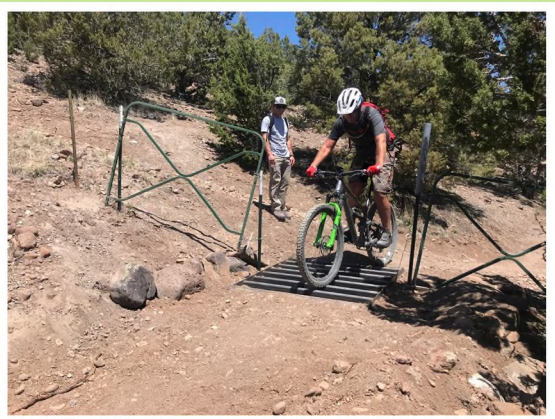
Trail Cattleguard on Sage Advice Trail

In 2022 the Cedar City Field Office (CCFO) installed five new trail cattleguards within the Beaver Bench Trail System. The CCFO designed this new style of cattleguard that mimics a full size cattleguard and is light enough to be installed by hand. These new flat cattleguards replaced arched cattleguards to improve safety and usability.