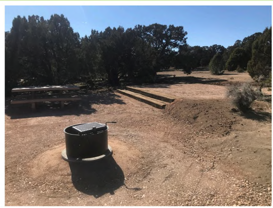
Newly-installed Fire Ring at Rocky Peak Campground

The Rocky Peak Campground was constructed in 2005 and has received tens of thousands of visitors over the past 17 years. Dilapidated fire rings were replaced in 10 of the individual campsites and one of the group sites. The new fire rings are taller and more accessible for all campers.