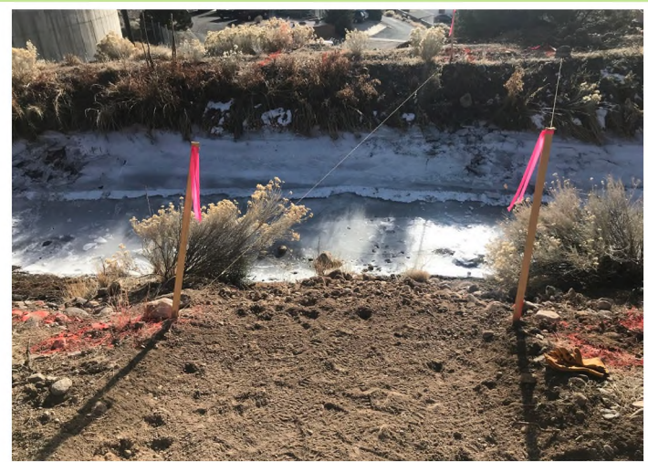
Beaver Bench Trail System Bridge Location