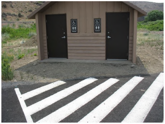
Big Pines Outhouse

The BLM Wenatchee Field Office (WFO) spends recreation fee money each year on a contract to pump outhouses at BLM's four Yakima River Canyon recreation sites and Liberty campground, a total of 16 outhouses. Outhouses are pumped twice per year by a local contractor at a cost of approximately $22,000/year. This "must do" contract is one example of the maintenance and operations projects accomplished using recreation fee money, keeping sites running smoothly.