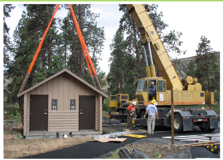
New outhouse installation