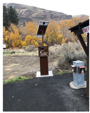
New Umtanum ROK

The BLM WFO installed a Remote Offgrid Kiosk (ROK) remote pay station unit at the Umtanum Recreation Site in the Yakima River Canyon of central Washington state on May 11, 2022. The Umtanum ROK is the second ROK unit that BLM has installed in the Yakima River Canyon (Roza was the first location in 2021). Both ROK units have been popular with the public, who have appreciated another option to pay the BLM site use fees. ROK unit cost: $7,000 + $2,500 annual service fee.