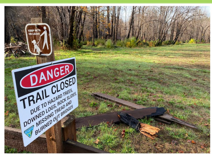
Recreation site improvements

The Roseburg District will continue to focus on Archie Creek Fire Recovery activities, while moving forward on multiple planning efforts to improve recreation opportunities within the North Umpqua, Rock Creek, and Little River corridors. Collected recreation fees will support the following activities: