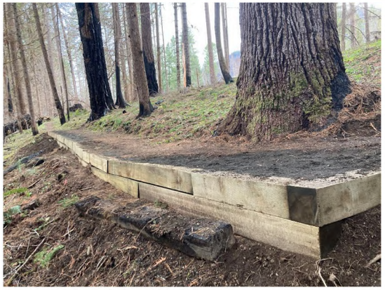
Retaining Wall Reconstruction

Collected recreation fees helped fund the restoration of trail retaining walls along the loop trail at Susan Creek Campground and supported maintenance worker staff time. Staff time provided oversight to South Coast Business Crew and additional maintenance crew support. Recreation fees supported testing and repairs to water systems and deferred maintenance at multiple sites. Extensive re-gravelling was done within campsites and along trails around Susan Creek and Susan Creek Falls Trail.