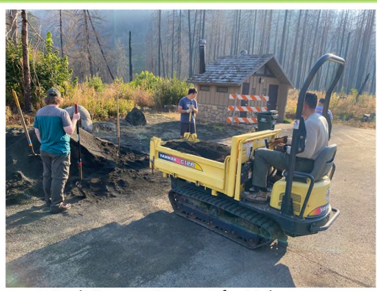
Park Ranger Support for Volunteers

The Roseburg District funded one Park Ranger with the use of collected recreation fees. The Park Ranger provided regular patrols and usage monitoring of the District's campgrounds and recreation sites. They also provided coordination and logistical support for multiple community volunteer clean up and National Public Lands Day events. Fee dollars supported staff time for restoration of popular campgrounds and trails, including Susan Creek Campground and Falls Trail.