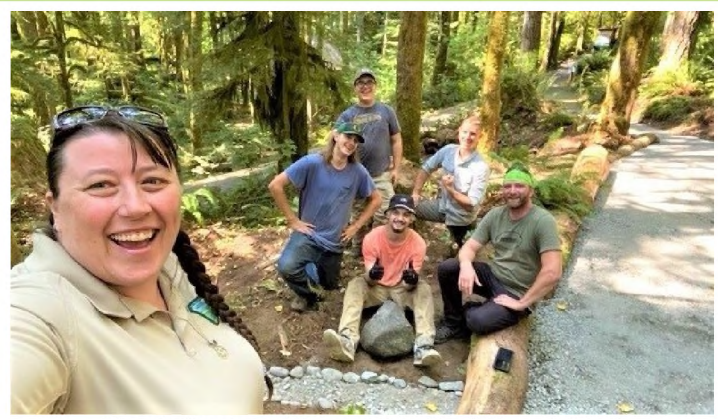
Youth Crew and Recreation Staff Repair Trail

Northwest Oregon District Park Rangers and local volunteers from Ant Farm Youth Crew restored the Salmon River Trail located in Wildwood Recreation Site in Welches, Oregon. Nearly 2 years ago, a tree fell on the raised boardwalk rendering it unsafe for public use. Ant Farm dismantled the remaining boardwalk, smoothed out the pathway, added gravel, and transplanted vegetation.