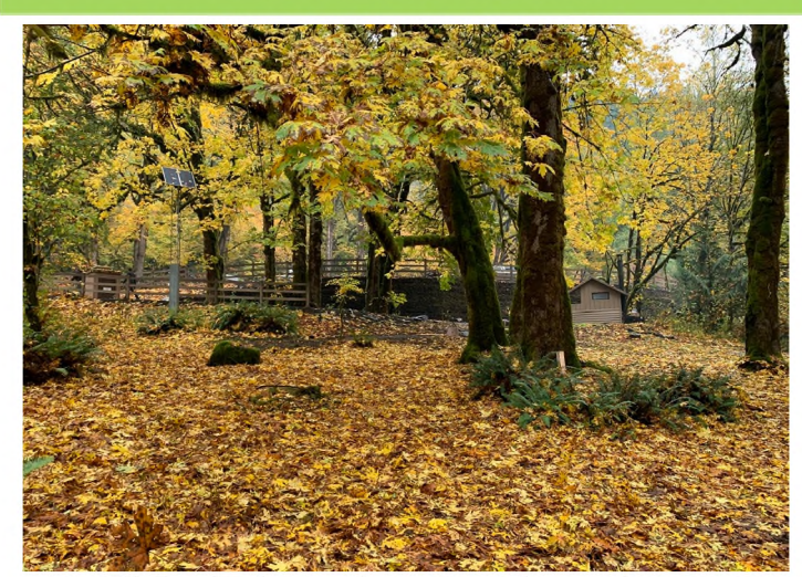
Elk Bend solar panel array to replace and move