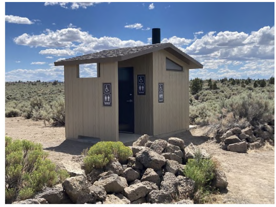
Newly installed vault toilet

Crack-In-The-Ground is one of the Lakeview Field Office's most popular recreation sites. With the increase in visitation, replacement of the old vault toilet became necessary. Using a variety of funds including recreation fee funds, the old vault was demolished and replaced in 2022. Contractors also installed a new informational kiosk at the site. This project was the first of four vault toilets that are planned to be replaced.