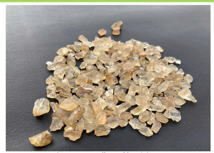
Sunstones collected by visitors

Purchase and install new accessible vault toilets at Sunstone Public Collection Area and Hart Bar Day Use Site. Funds have been saved for larger projects - $60,000