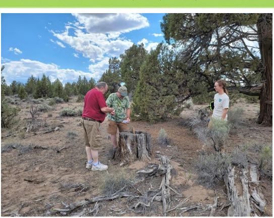
Geocahers and BLM Park Ranger at Stumpied geocache

The Christmas Valley Back Country Byway GeoTour officially launched on June 29, 2022, to coincide with the 33rd anniversary of the Byway's designation. Over the July 4th weekend, approximately 300 experienced and new geocachers traveled to North Lake County, Oregon, to try and complete the 28-cache GeoTour. Since its launch, the Tour continues to be a success, with cachers out most weekends and coming from as far away as Germany to participate.