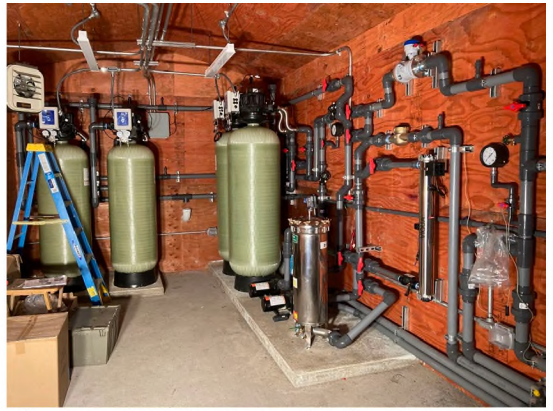
The new water treatment facility at Loon Lake.

The Loon Lake Recreation Site reopened for the 2022 season with new facilities. The BLM used funds to purchase and construct the water treatment system, maintenance building, and restroom after the original buildings were destroyed in a 2019 snowstorm. The water treatment system is a complete upgrade while the new restroom allows for continued access to facilities. The new buildings enhanced visitor enjoyment, health, and safety.