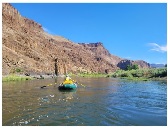
117 Wild and Scenic River miles inventoried

River rangers inventoried campsites along the John Day Wild and Scenic River in preparation for an updated boater's guide. Rangers collected GPS points, photographs, and campsite condition data at historically inventoried sites within the 117 miles of river between Service Creek and Cottonwood. Staff also inventoried new sites and collected additional information that might be helpful for future boaters.