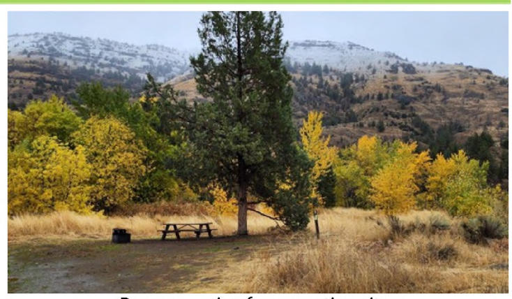
Rangers caring for recreation sites

Rangers oversaw the maintenance and care of developed and non-developed recreation sites along the John Day Wild and Scenic River and the North Fork of the John Day River. Rangers removed over 4,300 pounds of garbage, 135 piles of toilet paper, and 122 unauthorized fire rings. Staff controlled weeds and cleared overgrown vegetation. Rangers also provided information and assistance to recreators while checking boater permits at launch sites.