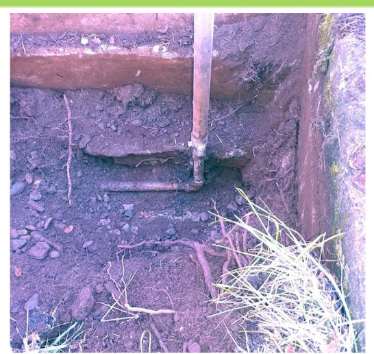
Broken Water Line in Hyatt Lake Campground

In 2023, Hyatt Lake Recreation Area will be closed for utility upgrades. Great American Outdoors Act funding has been secured to replace the water, wastewater, and electric lines in the Hyatt Lake Recreation Area. While the campgrounds are closed we are planning to do more work on meeting the International Dark Sky Association's requirements so that we can apply for a Dark Sky designation for portions of the Cascade-Siskiyou National Monument, which would include the Hyatt Lake Recreation Area. In particular, we will be looking at the lighting in the campgrounds and how we can change the lighting to meet Dark Sky requirements.