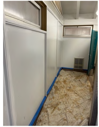
Painting Interior of Restroom

For the 2022 camping season, we had two couples for campground hosts that went above and beyond in their duties. Not only did they keep the campground tidy and restrooms cleaned for campers, they also took on a lot of painting. During the season the campground hosts painted the interior of three restrooms and painted all the picnic tables in the Mountain View Shelter and Osprey Kitchen, 19 in total. Their hard work and dedication were noticed by campers who left notes and online reviews.