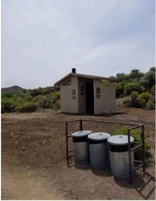
Frog Springs Vault Toilet

The Burns District was selected to pilot the remote offgrid kiosk (ROK). The ROK allows visitors to pay recreation site use fees on site using credit or debit cards. The ROK was installed in May 2022 and shut down for the season in November. During this time, 14.7% of campground funds were collected from the ROK. In Fiscal Year 2023, the ROK will be moved to Fish Lake Campground, a higher use site.