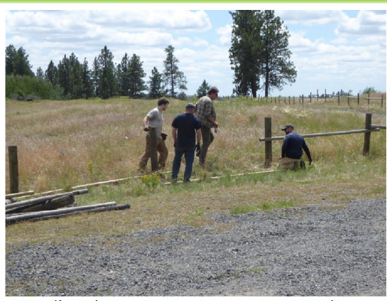
Trailhead Fencing Maintenance at Fishtrap

Additional BFO expenditures of collected recreation fees included $1,500 for a truck lumber rack and toolbox to support trailhead, recreation site, and fence maintenance efforts; and $181 for monthly port-a-potty rental at the popular Hog Lake Loop Trail Trailhead in the Fishtrap Recreation Area. Recreation maintenance and prevention helps BLM to preserve quality of recreation experience and protect resources, benefiting recreation visitors, including for SRP events. Fishtrap is a busy rec area near the Spokane metropolitan area.