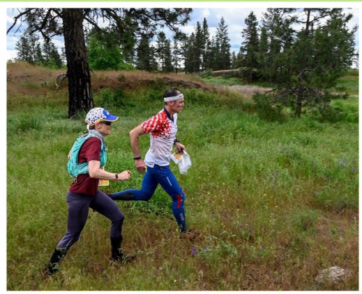
Orienteering SRP Event at Fishtrap

In Fiscal Year 2022, Bureau of Land Management (BLM) Border Field Office (BFO) monitored both Special Recreation Permit (SRP) and non-permit annual recreation visitation at the very popular Fishtrap Recreation Area. Five SRPs are permitted annually at Fishtrap: two horseback pointer breed dog trials, two walking tracking dog trials, and one orienteering event. In 2022, the BLM spent $3,010 for five new traffic counters, three of which are utilized at Fishtrap.