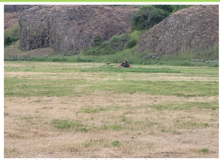
Crab Creek Dog Trial SRPs Grounds Maintenance