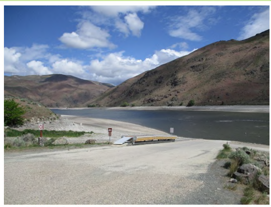
2022 National Public Lands Day (NPLD)

Spring Rec is Baker Field Office's only fee site with 25 campsites, a boat launch, five restrooms, and a fish cleaning station. Spring Rec is located at the south end of the Hells Canyon Recreation Area. Catfish and crappie mixed with largemouth bass make this area a popular fishing destination. Funds generated from Spring Rec's fees are spent on cleaning supplies, toilet paper, trash service, and a camp host. Collected fees also supported a 2022 NPLD with volunteers.