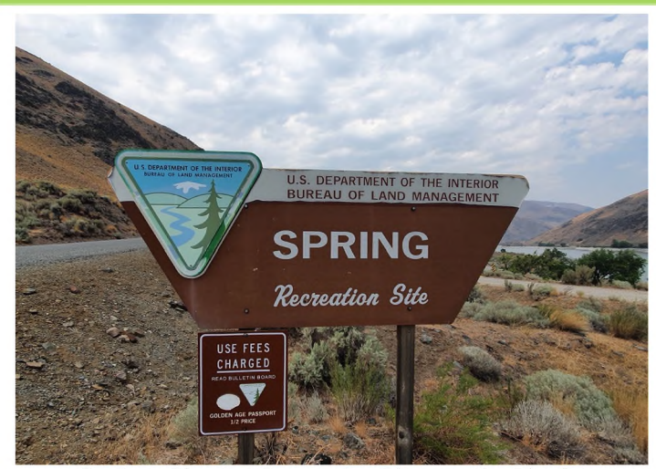
Replace Signs at Recreation Sites on the District

Future planned site improvements include increased patrols and updating our sign inventory. Sign ordering has begun and future plans are to order and replace all of the signs at Spring Rec and on the Wallowa & Grande Ronde River. In 2022, we added a maintenance ranger to our staff, which has given us an extra hand, allowing flexibility to combining forces to accomplish maintenance and improvement projects. The collected recreation fees will also help us support the labor costs for the seasonal River Rangers. We are actively recruiting for a Camp Host in 2023, which is primarily supported by the collected fees as well.