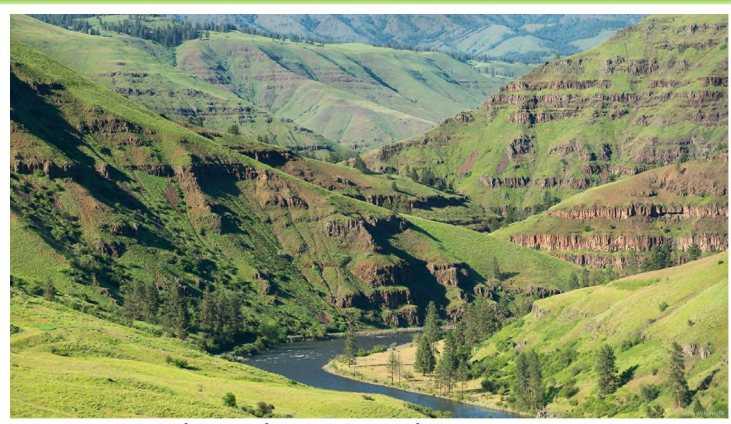
Mud Creeek Boat Launch Improvements

Mud Creek is a popular boat launch on the Wallowa & Grande Ronde River near the boundary to BLM lands. The BLM cooperates with the State of Oregon and the USDA Forest Service to manage this 58-mile stretch of river operations, which is entirely patrolled by BLM River Rangers. We meet in both spring and fall to communicate ideas and discuss future river projects. We are working to leverage collected recreation fees for future site improvements to the existing river operations facility at Minam.