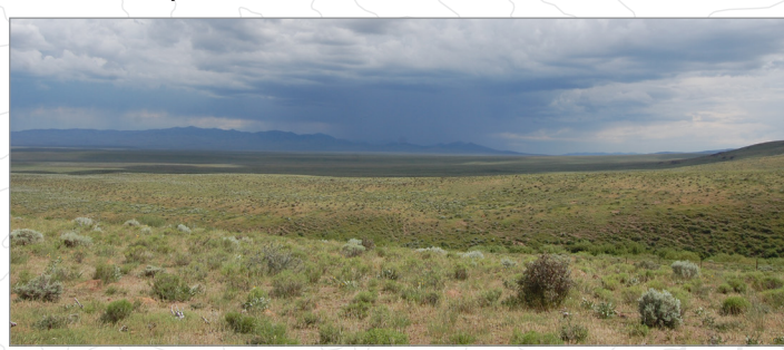
Upper Humboldt and O'Neil Basin area.

This effort will complement $2.12 million of funding from the Bipartisan Infrastructure Law.