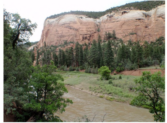
Rio Chama Wild and Scenic River

A Rio Chama camp host spent a second season completing compliance checks on commercial and private river trip launches and controlling congestion at the boat ramps for those launching onto the Rio Chama Wild and Scenic River. Camp host duties included monitoring group size, the number of dogs and number and type of boats for each permit which will be used to help develop future river management plans. This has resulted in cost savings in time and money for the river program.