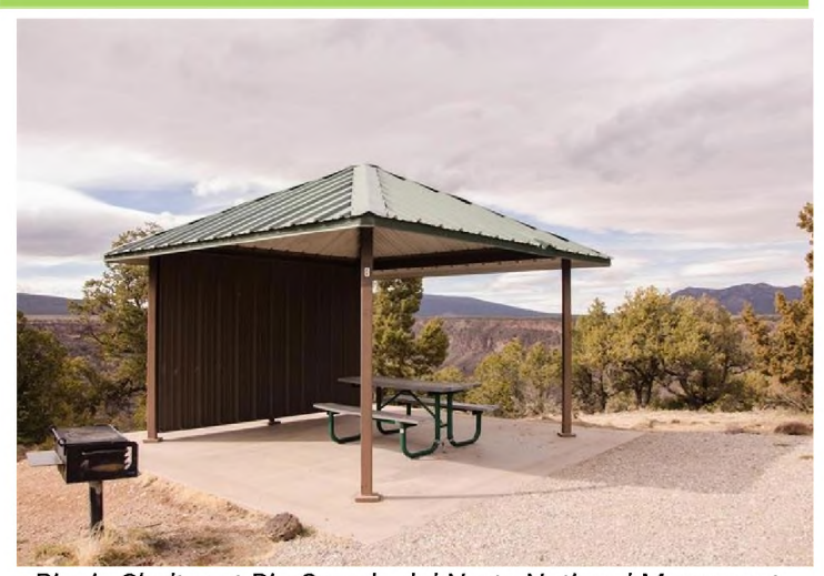
Picnic Shelter at Rio Grande del Norte National Monument