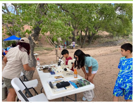
Biology Station at Fall Fish Fiesta

Santa Cruz Lake hosted a public interpretive event earlier this Fall. The event was attended by approximately 65 visitors. Children learned how to cast a fishing rod, saw micro and macroinvertebrates present in Santa Cruz Lake, learned about mammals in New Mexico, talked about boating and fishing safety, and learned about how they could protect the landscape with Leave No Trace principals. BLM partnered with New Mexico State Parks to provide information about the proper use of life jackets.