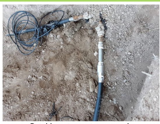
Potable water system upgrade

The Datil Well campground received an upgrade to its thirty-year-old potable water system. The system upgrades include a new storage tank, new water lines, and new spigots. The project is now freeze-proof and spigots are now ADA compliant.