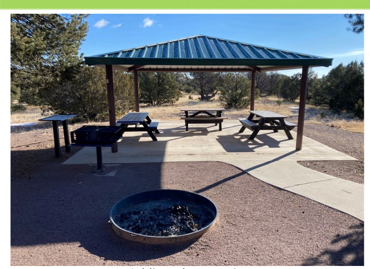
Additional group site

Establish an additional group site to meet the increased number of recreational users. The group site will include a new shelter, vault toilet, and parking/staging area as well as new fire rings and tables.