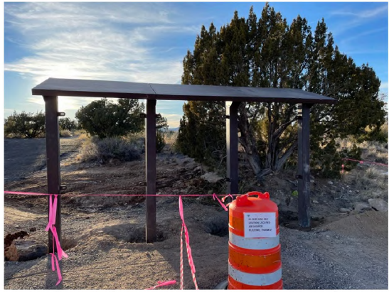
Installing Information Kiosk at Valley of Fires

During Fiscal Year '22 Roswell Field Office personnel implemented Recreation.gov at the Valley of Fires Recreation Area. This was done to encourage electronic payment of camping and day use fees using the Recreation.gov scan and pay system, and to allow campground users to make an online reservation at some of the sites. Federal Land Recreation Act funds were used to purchase kiosks, steel for sign-posts, signs, paint, and hardware.