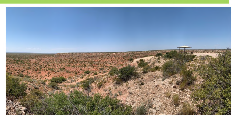
Haystack OHV Area

The Roswell Field Office manages two Off-Highway Vehicle areas, Mescalero Sands and Haystack Mountain. Both sites have projects in the works. BLM Roswell is currently working on campground upgrades at Haystack Mountain to include the addition of new amenities. A new information kiosk and new BBQ grills will be installed at Mescalero Sands as well. In fiscal Year '22, both areas utilized approximately $6,000 of funds to support facility operations and maintenance.