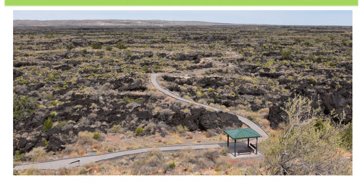
Visitors hiking the Malpais Nature Trail