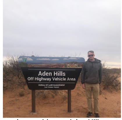
BLM employee with new Aden Hills portal sign

The explosion in off-highway vehicle (OHV) recreation has led to skyrocketing interest in the OHV areas within the Las Cruces District. Driving along Highway 54 from Alamogordo or I-10 from Las Cruces, it would be easy to miss the Red Sands or Aden Hills OHV areas. Combined, these two areas provide nearly 45,000 acres of open land for OHV enthusiasts. New portal signs, created and installed with 1232 funds, now greet visitors to these two areas.