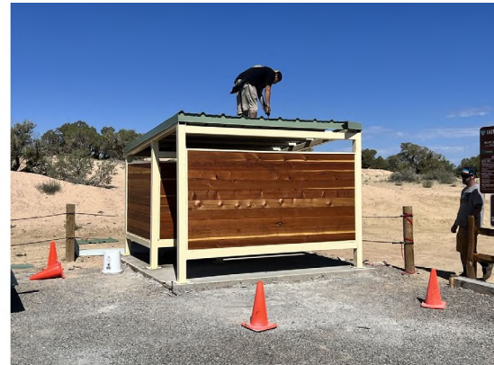
MTB Changing Booth

To further enhance the Calle Norte Trailhead, the Farmington Field Office installed a changing booth for public convenience. Building materials, cement slabs, sidewalks, along with a variety of landscaping and miscellaneous supplies were purchased with funds from Special Recreation Permits.