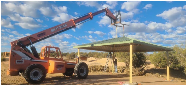
Construction of trailhead pavilion

The Calle Norte Mountain Bike (MTB) trailhead is a collaborative effort between BLM, City of Farmington, and San Juan County to provide a developed area for public access to the Glade Run Recreation Area MTB trail system.