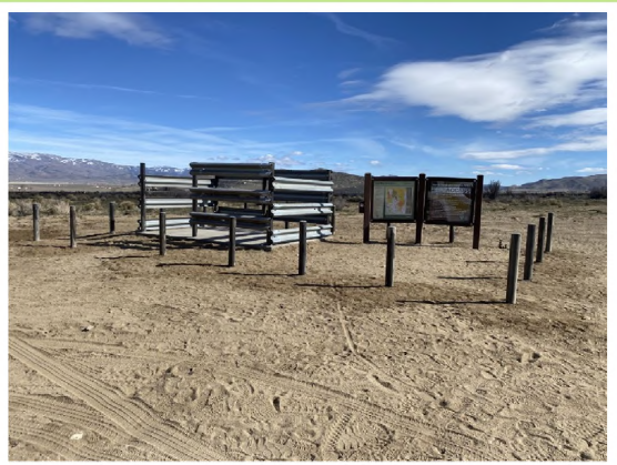
Newly Completed Portable Restroom Pad.

BLM, along with support from state and local partners, continued implementation of the establishment for the North Reno Recreation Area (NRRA) establishing the area as a developed recreation site. This effort promotes Public Health & Safety and mitigates resource concerns. The resulting work included the construction of two additional portable restrooms pads, kiosks, and updates to site/regulatory signs, as well as a contract for seasonal portable restrooms. Project costs totaled $17K.