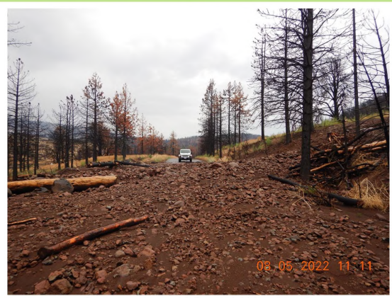
Campground Road Washout.

In 2021 the Tamarack Fire burned through Indian Creek Campground. Wildfire impacts to site facilities, hazardous materials needing abatement, and risks associated with wildfire-affected "hazard" trees necessitated a campground closure. In 2022 significant flooding in the area contributed to site issues related to access and public health and safety. The site will remain closed to the public to pedestrians as well as vehicles as staff works on public safety and infrastructure restoration.