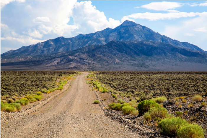
Basin and Range National Monument