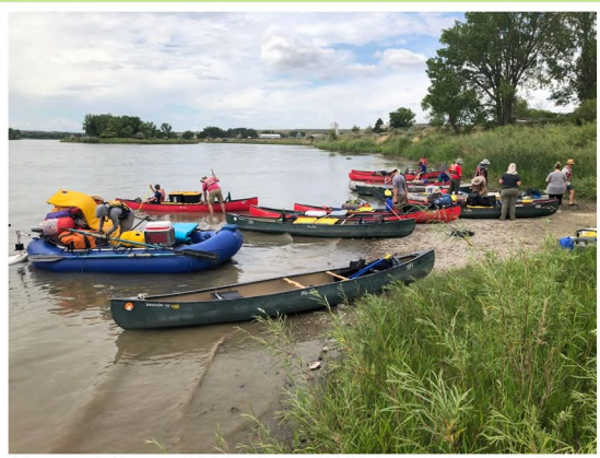
Upper Missouri National Wild and Scenic River

During the summer of 2022 the BLM UMRBNM, in partnership with the University of Alaska, conducted an Outcomes Focused Management study at sites along the Upper Missouri National Wild and Scenic River as well as five focus groups in gateway communities. The purpose of the OFM study is to further understand the experiences and benefits associated with a quality recreation opportunity on the Upper Missouri National Wild and Scenic River.