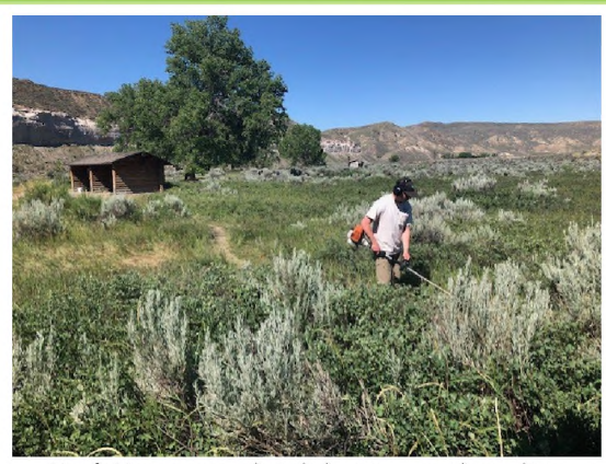
Park Ranger maintaining recreation sites

The BLM Upper Missouri River Breaks National Monument (UMRBNM) has three campgrounds, 26 vault toilets, and the 149-mile Upper Missouri National Wild and Scenic River. Maintaining these sites and facilities requires a multitude of supplies, such as: toilet paper, paint, gloves, disinfectant, and fuel for string mowers, to name a few. There are also expenses for maintaining equipment, such as: mowers, string trimmers, UTVs, and canoes.