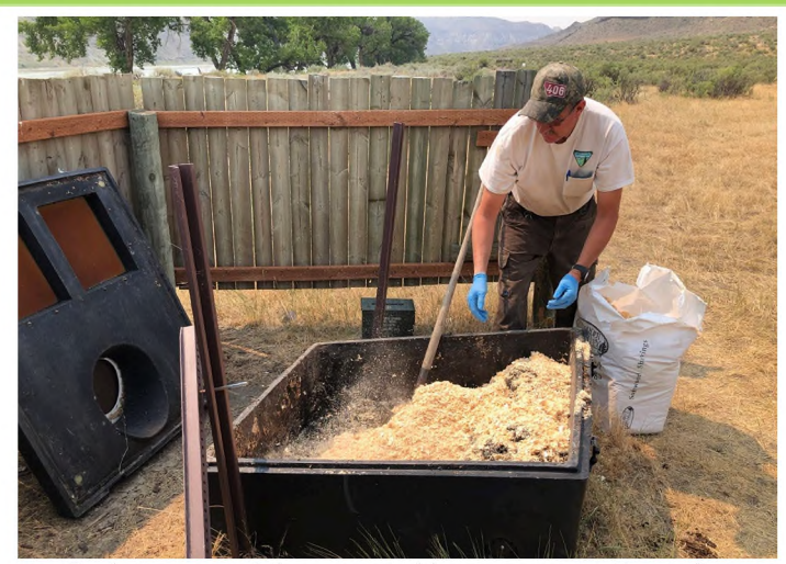
Park Ranger adding wood chips to composting toilet