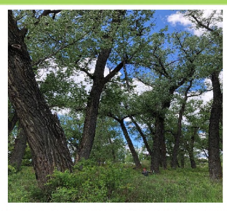
Crew member works to dislodge tree branch

Several cottonwood trees in the riparian area within Pompeys Pillar Area of Critical Environmental Concern were identified as hazardous due to dead limbs hanging precariously over the hiking trails. A contractor brought in a crew to remove those hazardous limbs and reduce the risk of a limb falling on a visitor.