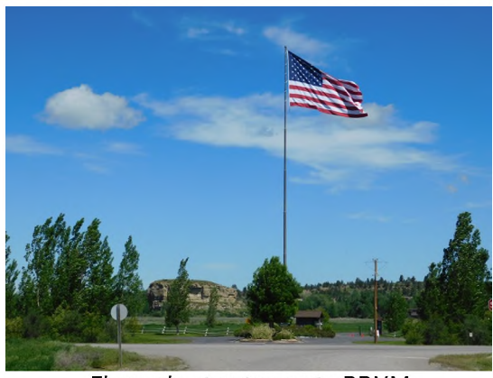
Flag pole at entrance to PPNM

The flagpole and gate post painting was completed in June 2022. A 120'-foot flagpole sits at the entrance to Pompeys Pillar National Monument (PPNM) and at one time it was the highest in the State of Montana. The steel flagpole was installed in 2008 and experienced some weathering and wear and tear. Work on the flagpole included prepping and painting the flagpole, various gate posts, and a vehicle barrier. It also included installing a new cable and truck (top pulley) on the flagpole.