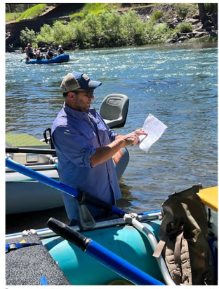
Blackfoot River Float-In Campsite Visit

5 new float-in campsites were established along the Blackfoot River. This complements our State Land Management Partnership and their 5 campsites. Fee revenue was applied to purchase a new raft for monitoring and compliance, as well as additional training and equipment for boat operators. This project gives the public an enhanced recreation opportunity in a highly desirable area otherwise closed to camping.