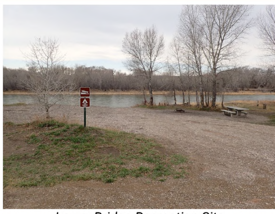
Lowry Bridge Recreation Site

The Lewistown Field Office (LFO) has been fortunate to have campground hosts at Lowry Bridge Recreation Site for many years. Because permitted fishing outfitters utilize the site for river access, permit revenue is utilized to reimburse the hosts. Through the assistance of the camp hosts, the LFO provides the public with a clean, safe, and enjoyable site for camping, floating, and commercial fishing opportunities. In FY22, the Field Office utilized SRP revenue for camp host living expenses.