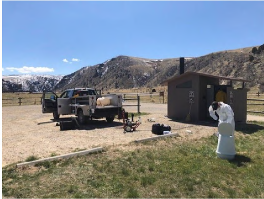
Staff Maintaining restrooms

The Dillon Field Office provides facilities catering to a wide variety of recreational opportunities. In FY 22 the Dillon Field Office spent $77,170 in FLREA funds on field supplies in order to maintain the recreation sites and facilities. These supplies ranged from the mundane expense of cleaning supplies to desperately needed replacement tools and equipment to maintain the recreation sites. These critical supplies help keep your public lands accessible.