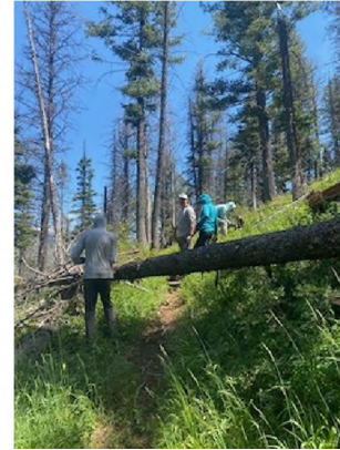
Park Rangers getting ready to clear trail

The Park Rangers are the first and often the last point of contact the BLM in the Dillon Field Office has with the public. In FY 22 the Dillon Field Office spent $6,710 in labor costs to keep our Park Rangers in the field. Our Park Rangers are there to answer questions, help explain what we do to preserve your public land, and perform critical day to day tasks to keep your public lands accessible for current and future generations.