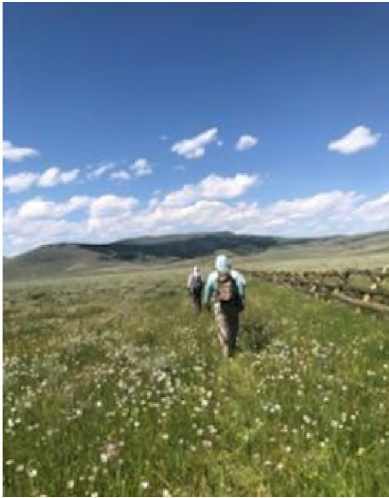
Park Rangers out on Patrol