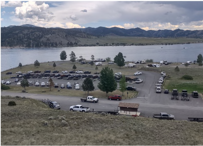
White Sandy on a busy day