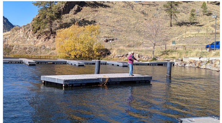
Volunteer Tasha assisting in dock removal

The BLM BFO was able to bring on 14 volunteers, as campground hosts and one set of day use site hosts. The volunteers were located at Holter Lake Campground (CG), Holter Dam Campground, White Sandy Campground, Devil's Elbow Campground, Clark's Bay Day Use Area, Divide Bridge Campground, and at Carbella Campground until the Yellowstone River flooded. These volunteers are reimbursed $30/day for incidental expenses and meals and are provided a campsite with full hookups.