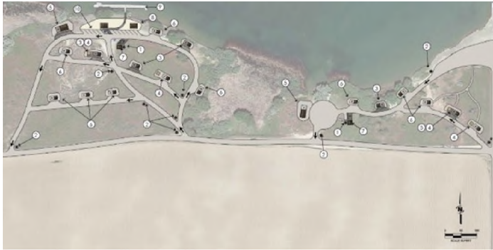
Wilson Lake Conceptual Plan.

The BLM Shoshone Field Office has saved funds to construct eight campsites, two vault toilets, day use parking, shade structures and upgrade access roads at Wilson Lake immediately north of Hazelton, Idaho.