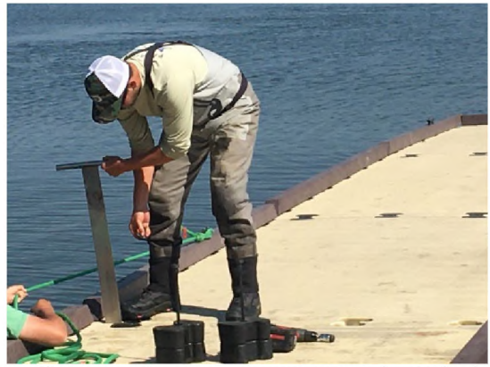
Intalling new dogs ears to reconnect boat docks

After a harsh winter in February 2022, the boat docks at Blackfoot Reservoir Campground got twisted with ice jams and the dog ear connectors broke in several locations. The dog ear connectors allow different sections of docks to be connected together. When the snow melted, and before the Blackfoot Reservoir became busy with boaters, the Pocatello Field Office hired Supreme Docks to install new dog ear connectors and prep the docks to get them ready for the boating and fishing season.