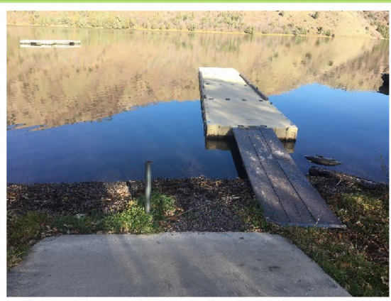
Installing new gangway at Maple Grove Campground

Due to high winds at Maple Grove Campground within Oneida Narrows Recreation Area, the gangway for a dock system broke. The Pocatello Field Office ordered a new one, but supply was low. The Pocatello Field Office installed non-slip boards to connect the docks to the shoreline so that the public could still use the dock. Supreme Docks, a local dock repair company, called and stated they had one in stock. The Pocatello Field Office purchased the new gangway and was able to install it.