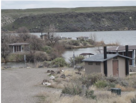
Cove Recreation Site

Having camp hosts at Cove Recreation Site is a great asset. The work they provide outweighs their cost by a large amount. Clean and well maintained facilities along with nice camp hosts create a welcoming visitor experience. The office also has consistent expenditures related to equipment maintenance that is used at the site. General expenditures every year include toilet paper, garbage bags, hand tools, and cleaning contracts.