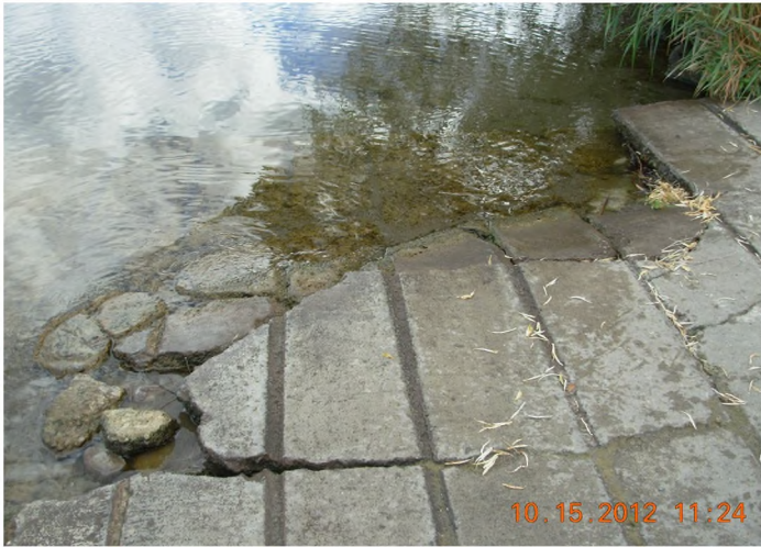
Deteriorating Boat Ramp

In an effort to provide a consistent funding source, the field office regularly carries money over from year to year. In the past, projects have nearly stalled when funding ran short, but carry over was utilized to keep the project on schedule. It is important to continue to maintain Cove Recreation Site and eventually finish it, so it can be used to its full potential, serving thousands of people per year. Fee money will be important in this endeavor. In 2023, the office will use fee dollars and Great America Outdoors Act funds to update the irrigation system, replace docks, replace boat ramp, repair aging or vandalized components of shade structures, and replace dead or dying trees and vegetation.