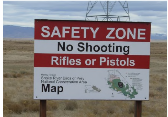
No Shooting Signs

Replacing aging signs is a constant workload. As signs age or are vandalized, they need to be replaced. Generally, several large and/or small signs need replacing each year.