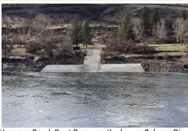
Hammer Creek Boat Ramp on the Lower Salmon River

The Cottonwood Field Office completed improvements to Old Lucile, Slate Creek, and White Bird boat ramps accessing the Lower Salmon River (LSR). These improvements will enhance access and provide a safer launching experience for visitors recreating on the LSR. Recreation fee site dollars combined with deferred maintenance monies were used to fund the improvement work. In total, seven BLM boat ramps were improved over the past several years.