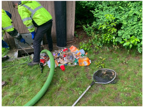
Underground Vault Sewage Collection

Annual fee dollars funded two major service contracts that supported the Recreation Program. The contractors performed human health and safety tasks by keeping developed facilities clean and orderly. Janitorial and lawn services are provided at Blackwell Island, Mineral Ridge Scenic Area, Beauty Bay Recreation Site, and the Wallace Forest Conservation Area. The Field Office also services twenty-seven 1000-gal vault toilets and one 3000-gal RV dump station at Huckleberry.