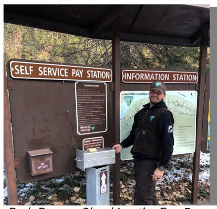
Park Ranger Checking the Fee Box

A major portion of annual fee revenues go towards completely or partially funding permanent, seasonal, and volunteer staff positions for the recreation program. In addition to funding program labor, these funds are spent on supplies, materials, and equipment that support operations and maintenance of developed infrastructure and assets. Coeur d'Alene sites also provide public interpretation and guidance of rules and regulations.