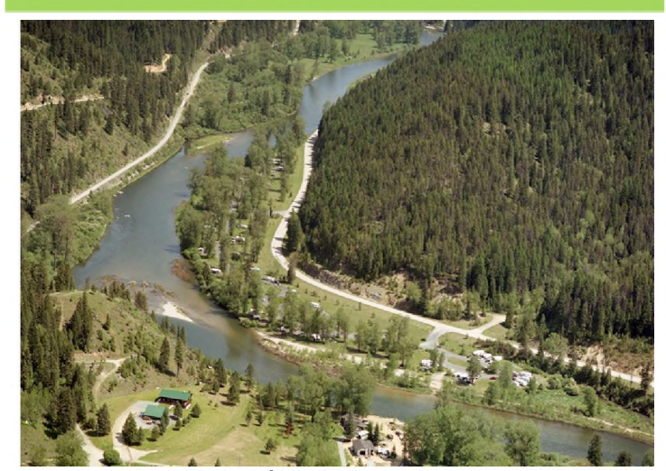
Arial Photo of Huckleberry Campground