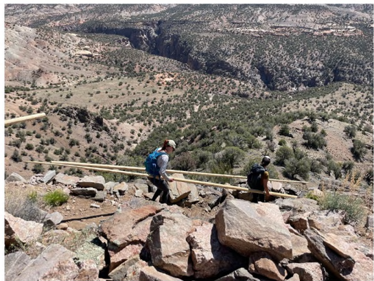
Volunteers hike tipi poles down Ute Trail

Rangers oriented visitors, helped groups select camps, ensured private and commercial compliance, and maintained campsites and facilities. Kiosk inserts were upgraded at trailheads. A new method of paying fees was introduced. A convex mirror was installed on Chukar Road, enhancing the safety of visitors. Ute Park pit toilet was rehabbed, providing a crucial amenity for visitors. Finally, new tipi poles and canvas were installed at the BLM Ranger Station, utilized for river patrols.