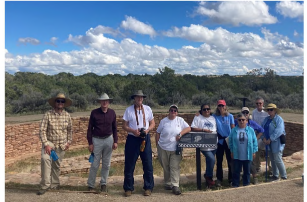
SRP Management - Crow Canyon Cultural Etiquette

The Special Recreation Permit (SRP) program at TRFO does not administer permits with substantial fees although there are over 50 permits to be managed. Funds generated from the 1232 TRFO SRP Program and Bradfield Bridge Recreation fee site help to pay half the salary of a GS-07 Park Ranger to administer the program. These permits not only help manage recreation and protect resources, but many SRP programs are education based or provide guidance for the clients to promote responsible recreation in cultural sites.