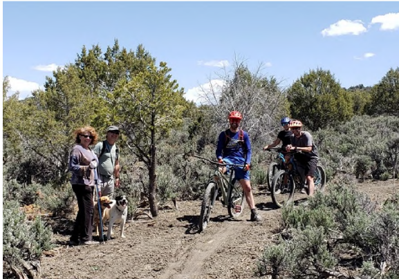
Mancos Trails Volunteers at Aqueduct Trail System

Tres Rios Field Office partnered with the Mancos Trails Group to continue work on the Aqueduct Trail System. Thanks to the combined efforts of the BLM and MTG over eleven miles of multi-use trails were constructed and wayfinding map kiosks were purchased for trail intersections. The Aqueduct Trail system offers beginner and intermediate trails for mountain bikes and class 1 e-bikes. The trail system is also open to hikers/trail runners, dog walkers, and equestrian use and offers fantastic views.