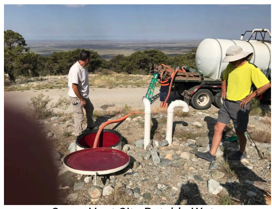
Camp Host Site Potable Water

Zapata Falls campground is an enormously popular site located adjacent to Great Sand Dunes National Park. Because of the added pressure from the Park, it is critical to BLM and visitor success there to have a host on duty. Previously, a limiting factor to attracting potential hosts there was a lack of water. BLM developed a cistern-type water system to provide the host with potable water throughout the season. That water, and the host themselves, are paid for out of the CG's fee collections.