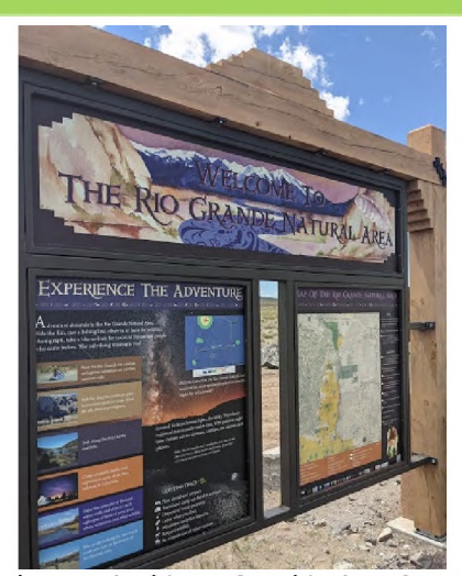
Landscape Architect-Graphic Arts Contract

Carryover from FY22 was a little over $30,000. That funding, combined with funding from collections throughout FY23, will contribute significantly to this year's Career Seasonal recreation maintenance position. Some of the carryover funding from FY22 will be used for Developed Recreation supplies associated with campground fee sites. Also this year, $10,000 from carryover funding is going into a new contract for Graphic Arts and Landscape Architecture services that will develop interpretive and education materials, as well as improved site designs for visitors that benefit fee sites, areas associated with SRP's and Passes, as well as other high-use visitor areas of the SLVFO.