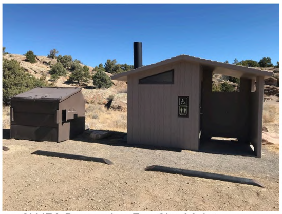
SLVFO Recreation Fee Site Maintenance

Collections from fee sites, such as SLVFO's two developed overnight campgrounds (Zapata Falls and Penitente Canyon), serve as the primary source of funding for the Field Office's seasonal Park Ranger. The Park Ranger is almost solely responsible for operations and maintenance at SLVFO developed recreation sites and serves a critical need for continuous upkeep of BLM's facilities, as well as vital coordination and support to seasonal campground hosts (who are also funded by fee area collections)