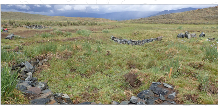
Work in Bolton Draw

The landscape of North Park is one of the best places in the state to visit and experience core sagebrush habitat. These sagebrush communities, home to one of the largest wetland complexes in Colorado, are at high elevations that are more resilient to impacts from a changing climate. The landscape boasts critical winter range and migration corridors for big game, and numerous culturally significant sites, including the Northern Ute Trail. Investment in aquatic, riparian, wetland and terrestrial habitat improvements, fuels reduction and invasive species management will preserve historic and cultural sites and enhance recreational opportunities.