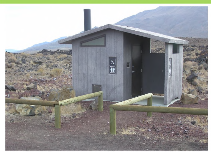
Fossil Falls Campground Accessible Vault Toilet $17,000 towards the ongoing cleaning, supplies, pumping, and maintenance of 14 different vault toilet facilities throughout the field office.

Approximately $30,000 worth of Recreation Fee Revenue dollars towards labor cost directly related to the processing, administration, and monitoring of the Field Office's Special Recreation Permit program.