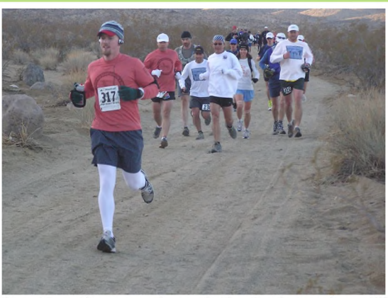
Ultra-Marathon run through the Rademacher Hills

Approximately 40 Special Recreation Permits for activities such as Equestrian Endurance Rides, Ultra Marathon running events, Four Wheel Drive and Dual Sport Motorcycle Tours, Vending, Mountain Bike, Motorcycle, Truck and Utility Terrain Vehicle (UTV) races occur within the Ridgecrest Field Office annually. Special Recreation Permits are the largest source of funds collected for the Recreation Fee Revenue program within the Field Office.