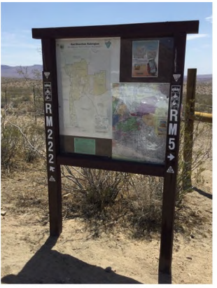
Visitor Information Kiosk

Funds were used to enhance and maintain the public lands visitors recreational experience. These efforts included cleaning and maintaining 14 different vault toilet facilities throughout the field office. These facilities can be found at the Fossil Falls Campground, Trona Pinnacles National Natural Landmark, and the Spangler Hills, Jawbone Canyon, and Dove Springs Off-Highway Vehicle Recreation Areas. Funding was also used to maintain and stock 100 Information Kiosk we have within our area.