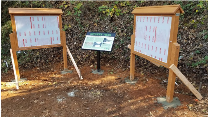
Kiosks for Maps and Trail Information

The Steven’s Trail is a historical toll road trail built in the late 1860’s for foot, horse, and pack mule trains to connect the Gold Rush towns of Colfax to Iowa Hill through the canyon of the North Fork of the American River. The Bureau of Land Management, with collaboration from the Placer County Historical Society, recently installed two kiosks for maps and trail information, an interpretive panel telling the history of the trail and a plaque commemorating the historical designation in 2002.