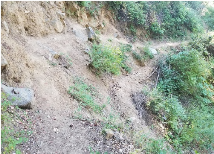
Slide on South Yuba National Trail