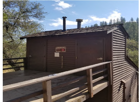
Long Beach Composting Toilet

The South Fork of the American River is the most boated whitewater section of river in California with well over 100,000 people annually. Between Chili Bar Dam and Folsom Reservoir, the BLM maintains three riverside solar powered composting toilets which the public has been using for almost 30 years. Two bathrooms need new decks, and one needs a new roof. Planning is all done and as soon as there is mid-week water scheduled staff will begin rafting in to finish the work already started.