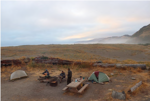
Mattole Campground and Day Use Area