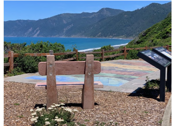
NCLS Monument at Black Sands Beach

Recreation fees collected in the King Range National Conservation Area (KRNCA) fund vault toilet pumping services for 8 bathrooms at four campgrounds and one high use day use area. Total visitation to these sites in 2022 was 129,280 visits.