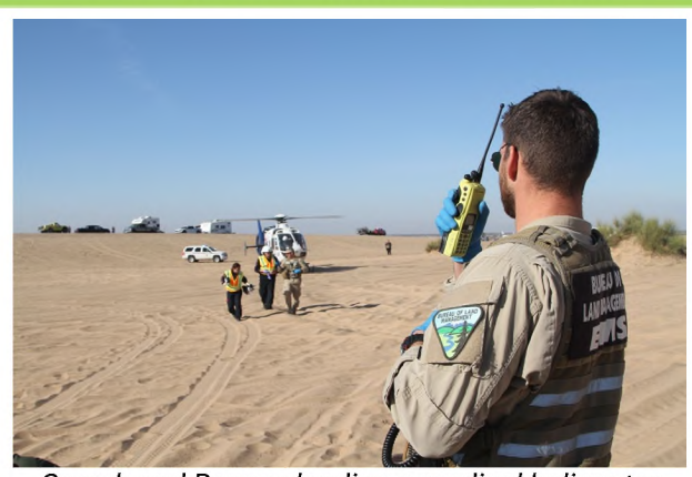
Search and Rescue landing a medical helicopter

The ECFO has one of the most robust and comprehensive off-highway vehicle Search and Rescue (SAR) programs within the department of the Interior. The ECFO emergency medical team responds to approximately 330 calls each season and are responsible for saving countless lives over the years. Annual training includes but is not limited to, swift water rescue, vehicle extrication, and Emergency Medical Services. Their skills and service help protect the wellbeing of about 1 million visitors annually.