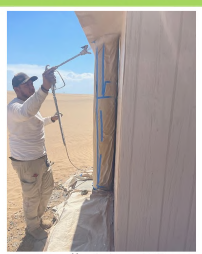
Maintenance staff painting a CXT vault toilet.