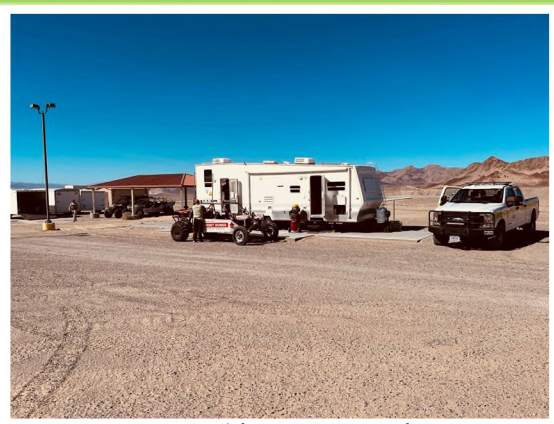
Dumont Dunes Incident Command Post Set-up

Barstow Field Office manages Dumont Dunes which is a very well visited area containing large sand dunes that extends 30 miles in length. Visitors enjoy open desert riding on dune buggies, ATV's, UTV's. Camping in large recreational vehicles is also popular. Law enforcement, fire crew, and visitor service staff assist visitors on busy holiday weekends with up to 25,000 visitors sometimes. The staff is available for questions, to provide support, and emergency medical assistance if needed.