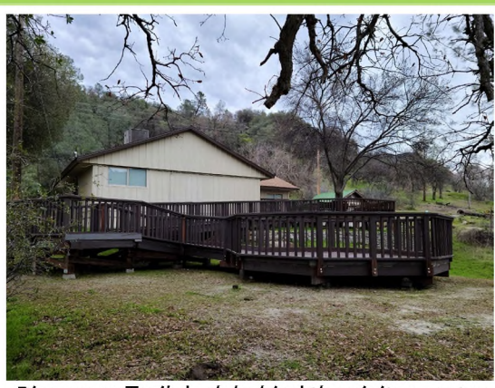
Discovery Trail deck behind the visitor center

The BLM completed construction of a large deck behind the San Joaquin River Gorge Visitor Center, which will be part the "Discovery Trail". The Discovery Trail is a self-guided interpretive trail for school aged children to teach them about the local animals that reside in the Gorge. Additionally, nearly 2-tons of trash and old construction materials were removed from Visitor Center and Learning center. This construction and cleaning enabled the Visitor Center to re-open in November 2022.