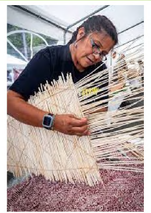
Cradleboard making demonstration

In a new partnership with the Sierra Foothills Conservancy, the BLM was able to sponsor a highly respected tribal elder from the Cold Springs Rancheria of Mono Indians of California to conduct multiple interpretive programs for local schools. These programs consisted of teaching over 600 students, teachers, and parents about the daily life of Native Americans that resided in the area surrounding the San Joaquin River Gorge.