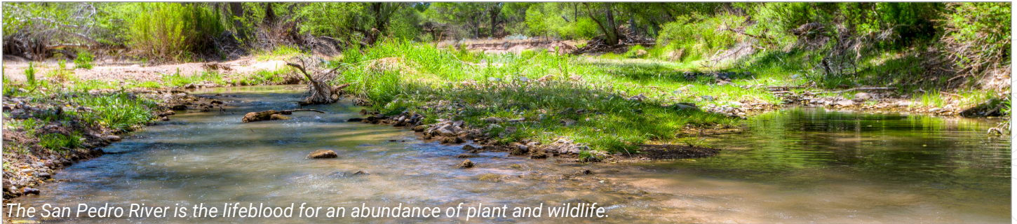
The San Pedro River is the lifeblood for an abundance of plant and wildlife.

The Bureau of Land Management is infusing $161 million for ecosystem restoration and resilience on the nation's public lands, as part of the Biden-Harris Administration's Investing in America agenda. The proposed work will focus on 21 "Restoration Landscapes" across 11 western states, restoring public lands, strengthening communities and local economies, advancing climate resilience and furthering our commitment to Tribal collaboration and partnership.