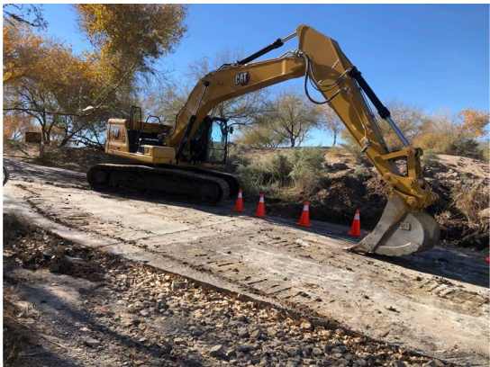
Excavator on Boat Ramp

Yuma Field Office (YFO) continued to enhance existing amenities at recreation sites and replaced worn out or no longer serviceable items.