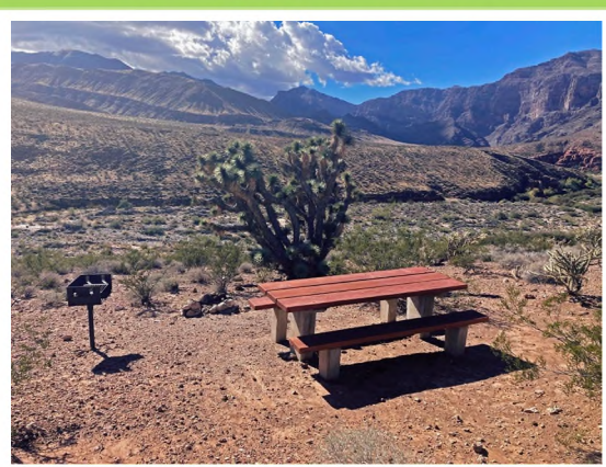
Stained Picnic Table

Before the reopening of the Virgin River Canyon Recreation Area on April 8, 2022, all 86 of the recreation area's picnic tables were stained. Along with this effort, all 61 fire pits and 51 standing grills were cleaned out and painted.