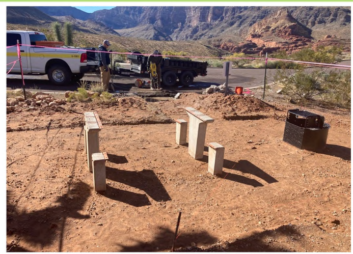
Campsite accessibility improvements

In October 2022, we plan to complete additional parking delineation at Lime Kiln Canyon Climbing Area to prevent vehicle parking from expanding into an Area Managed for Wilderness Characteristics.