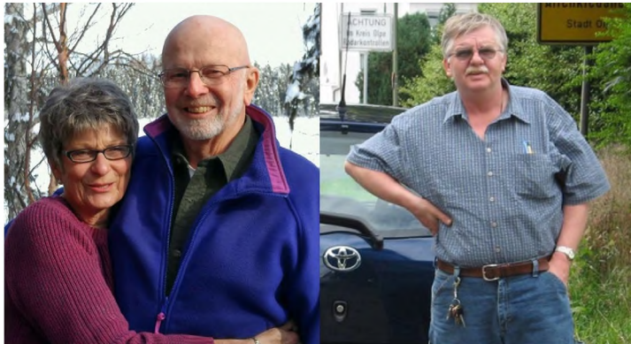
Campground Hosts: Fortymile Wild and Scenic River

These amazing volunteers contribute over 2,000 hours annually as campground hosts in support of the Fortymile Wild and Scenic River recreation program. The campgrounds are remotely located along the Taylor Highway – hours away from community services. Public feedback on the campgrounds shows that these volunteers are doing an impeccable job. The campgrounds are often described as some of the cleanest campgrounds on the Alaska road system.