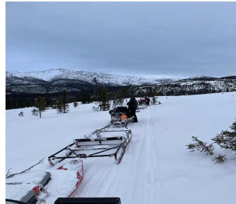
Recreation Staff grooming trails in the White Mountains NRA

Term and seasonal staff are essential to the public safety and overall experience in the White Mountains National Recreation Area (NRA). In the summer they maintain waysides, trails, cabins, and campgrounds. The winter recreation program grooms 250 miles of trails and maintains 12 remote public use cabins and two trail shelters.