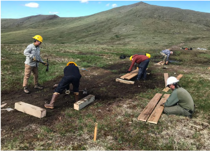
BLM Staff and SCA Crew installing new boardwalk