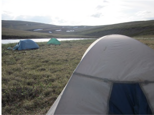
Camp site in RDO

The Arctic District Office (RDO) issues authorizations to permitted guides for special recreation permits (SRPs) that offer hunting opportunities to small groups for species such as caribou, moose, and grizzly bear. Often, these groups will operate out of spike camps for the length of their guided hunt, which is typically a week or less.