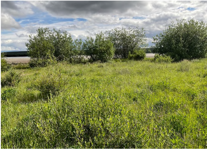
Site for picnic shelter and picnic table.

For fiscal year (FY) 2023, RDO plans on creating a new recreation site by constructing a picnic shelter and table on BLM-managed lands along the Colville River at Umiat. The site is located at a popular take out spot for boaters, guided tour operators, and hunters in the area.