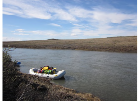
Boat ready to go in RDO

Hunting isn't the only reason people visit lands managed by RDO. The RDO also processes SRP authorizations for guided rafting, hiking, and wildlife viewing tours. These trips often require overnight camping at multiple locations along the route, typically for no more than two nights at each spot.