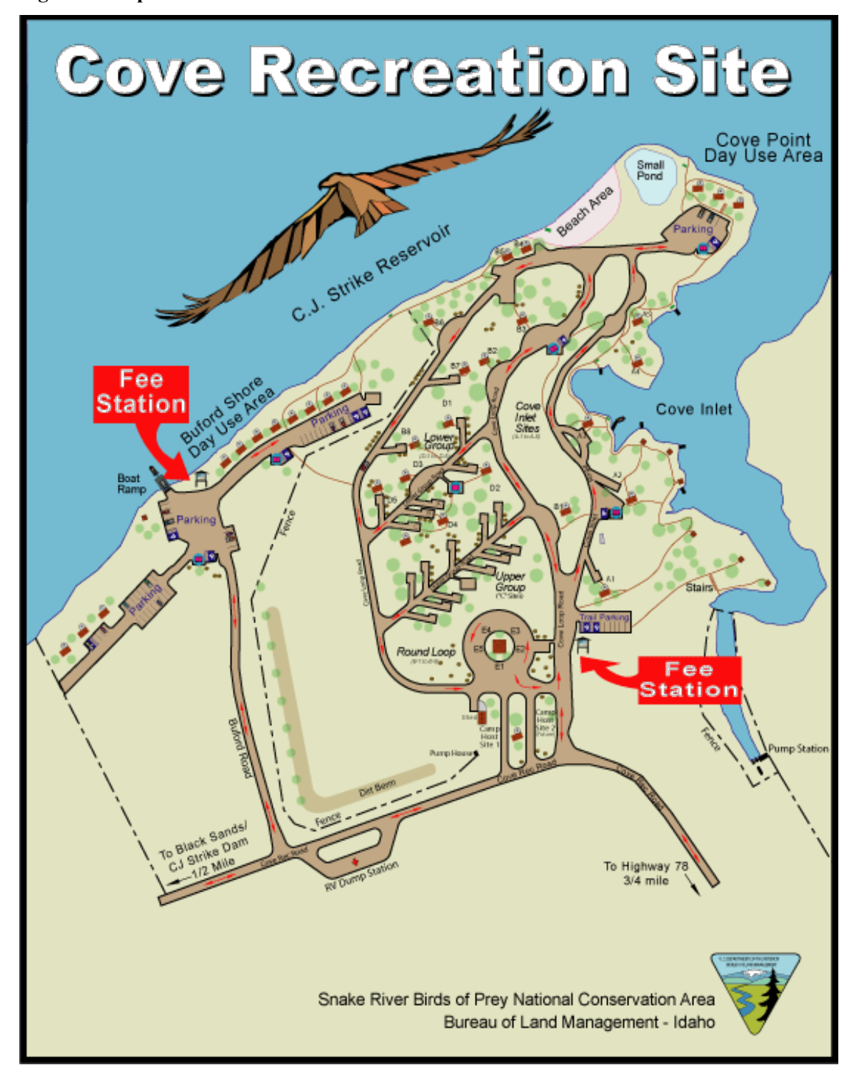
Figure 4: Map of Cove Recreation Site