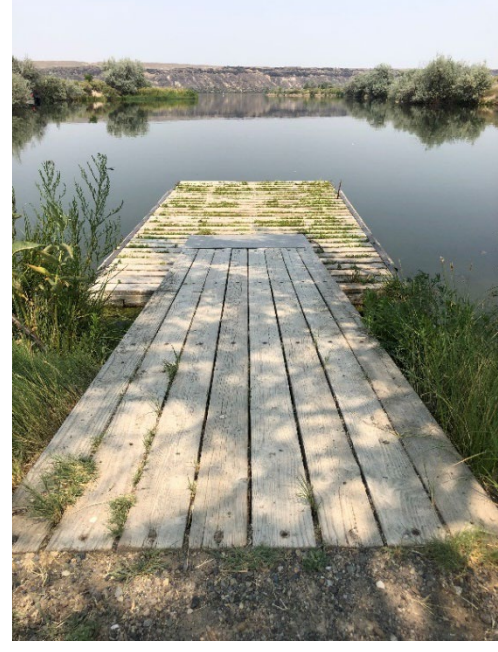
Figure 6: Aging boat dock