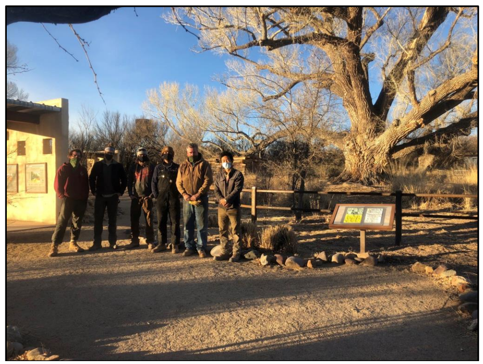
Figure 4. Vegetation clearing team at the San Pedro House.