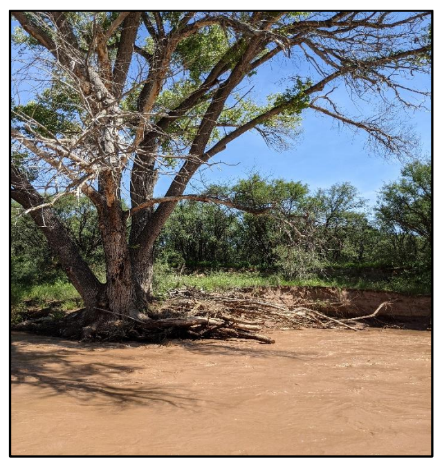
Figures 2 & 3. Monsoon waters in the San Pedro River following an unusually wet monsoon.