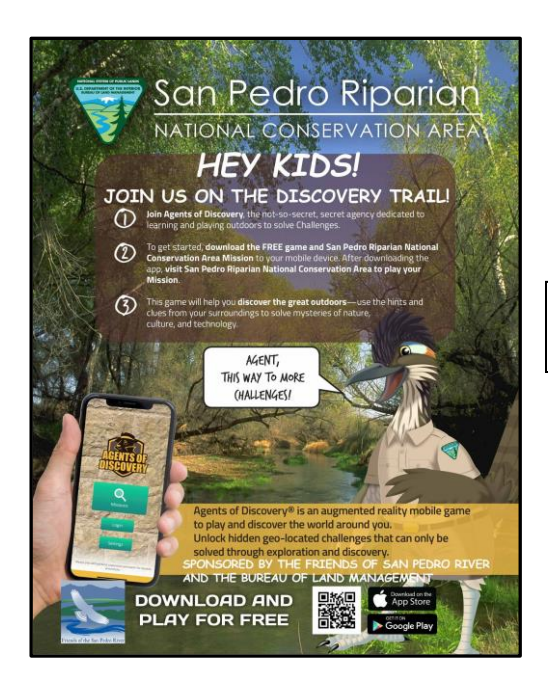
Figure 1. Agents of Discovery informational flyer for SPRNCA missions.