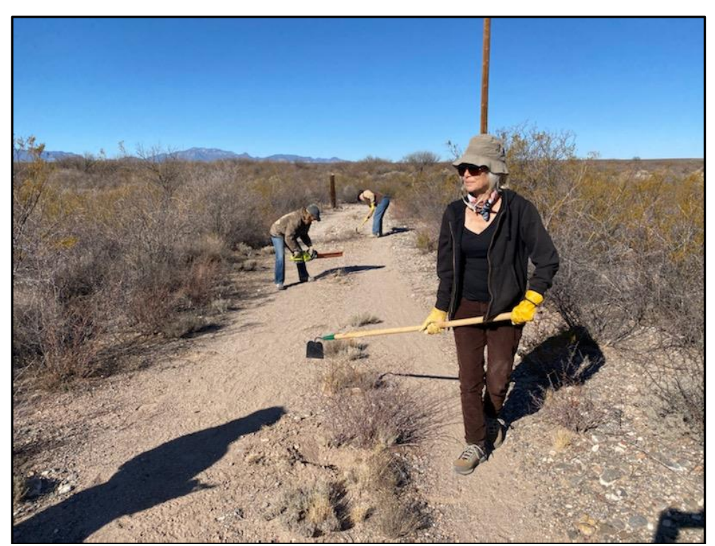
Figure 5: Escapule Adopt a Trail volunteers working on removing vegetation within the trail.