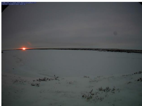
This November 24, 2022 photo depicts the last transmitted image of river ice conditions along the Colville River near Ocean Point.

Water Stage Height (Stage 2): 7.65' (above MSL) Water Temp (Temp 1): 31.8°F Air Temp (1-week high): 35.06°F Air Temp (1-week low): -4.0°F Air Temp (1-week avg): 15.53°F